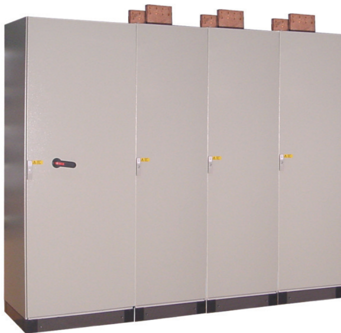
POWER STATION pe5040-W, front view, with 1000mm-supply cabinet

Water cooled DC power supply in switch mode technology, designed for the direct installation at the electroplating tank.