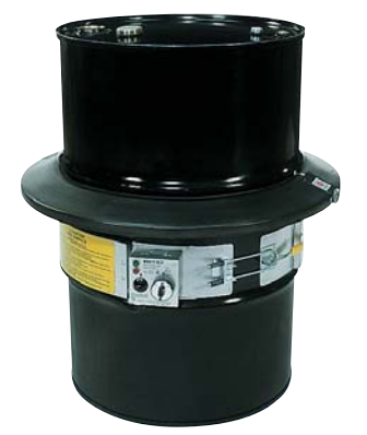
ture and then will go on and off as the thermostat cycles.

Model TRX-55 is equipped with two pilot lights; one green the other red. The GREEN pilot light will glow continuously as long as the heater is plugged into an active electrical outlet. The red pilot light will glow until the heater reaches the thermostat set tempera-